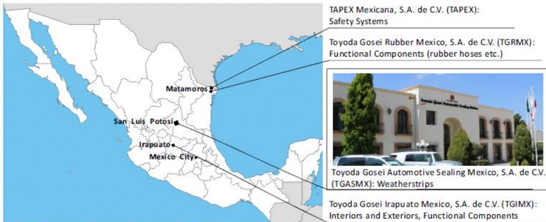
Production System in Mexico